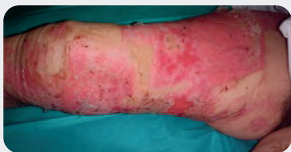
F) Six days after silicone gel application the wound was completely healed.